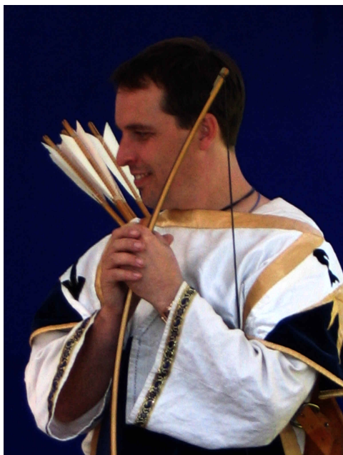
Marcellus, Champion of the Bow