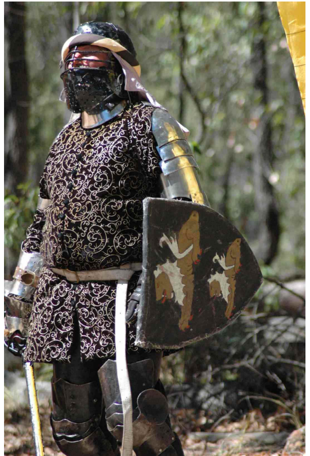
Sir Kane Graymane