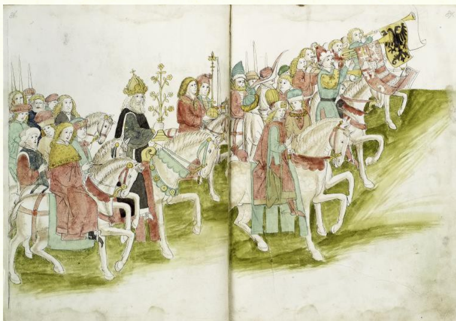
Emperor Sigismund with the golden rose. 1460

Newsletter for the Barony of Aneala Society for Creative Anachronism