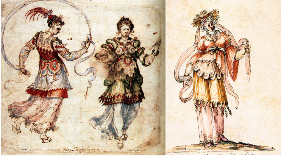
I:\Examples of Masque Costume in the late 16th & Early 17th Centuries.mht