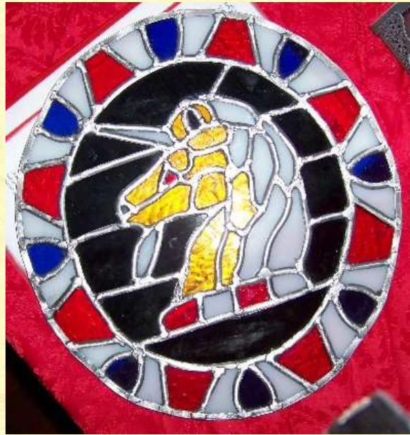
Photo by Lady Alianore de Essewell, Lead light by Viscountess Rhianwen