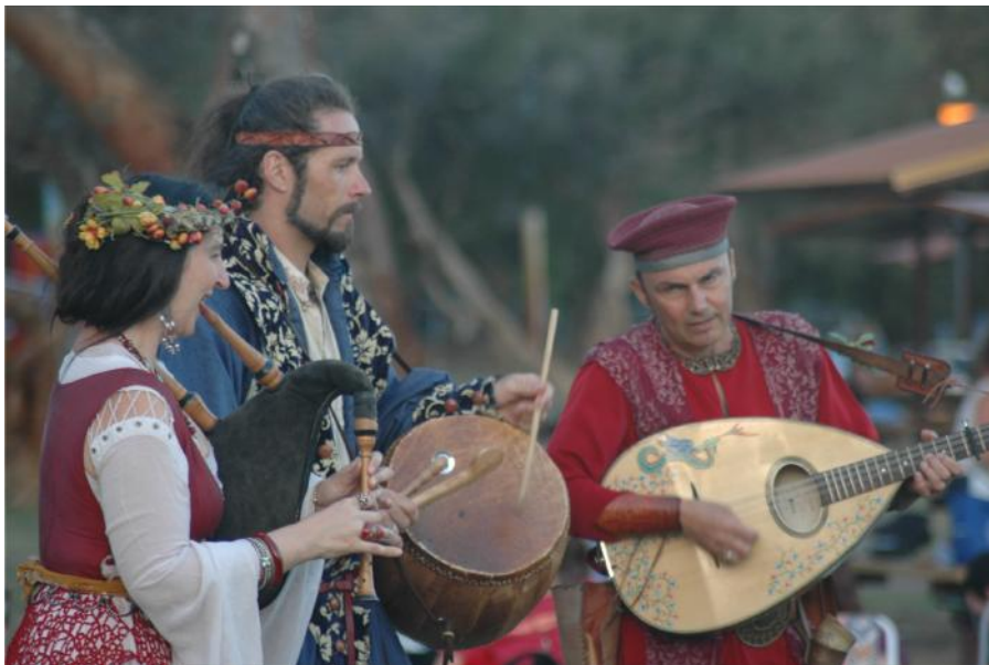
visiting french musicians january 2008