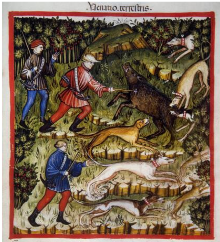
TACUINUM SANITATIS. 14TH CENTURY. MEDIEVAL HANDBOOK OF HEALTH. BOAR HUNTING. FOLIO 96R