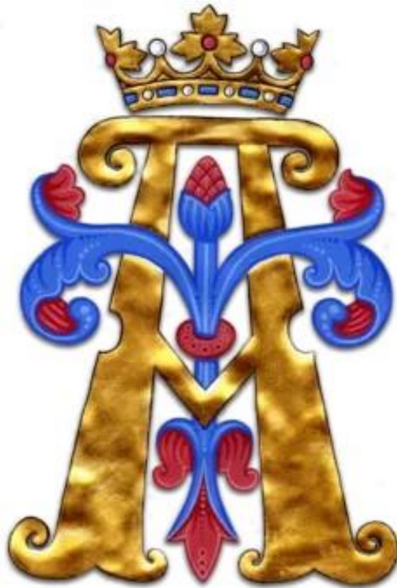
ILLUMINATED LETTER A