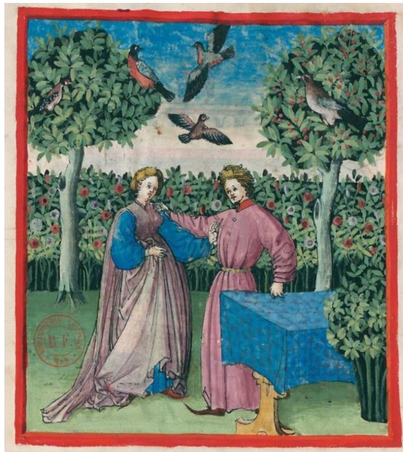
TACUINUM SANITATIS. 14TH CENTURY. MEDIEVAL HANDBOOK OF HEALTH. HAPPINESS. FOLIO 102V