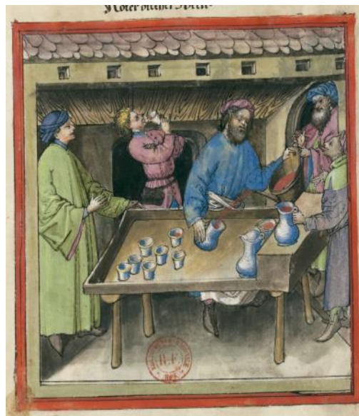
TACUINUM SANITATIS. 14TH CENTURY. MEDIEVAL HANDBOOK OF HEALTH. RED WINE FOLIO 86R

Pour the sauce over the meat, and serve hot.