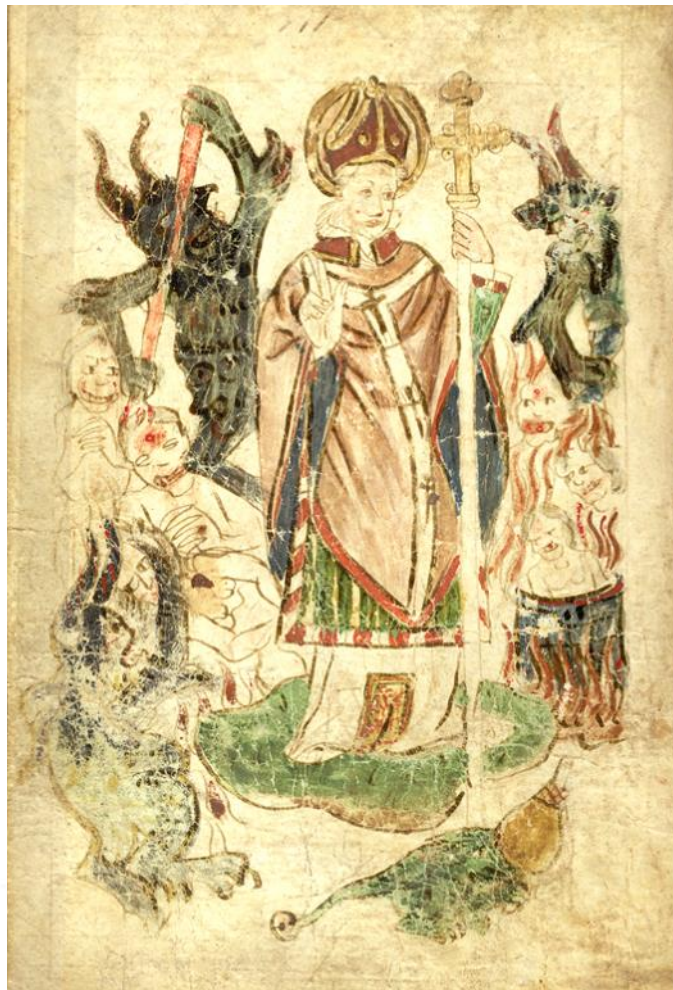
St Patrick standing on a snake in Purgatory: England, 1451 (London, British Library, MS Royal 17 B XLIII, f 132v)